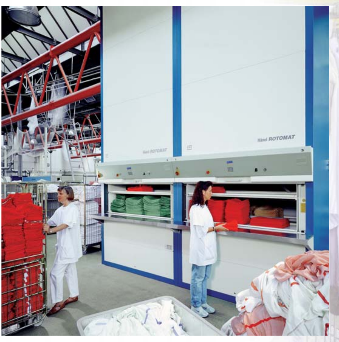
This Rotomat® system has one access point at the front and one at the back. The ironed laundry is stowed away at the back and taken out as needed from the front.