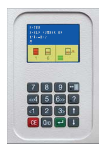
MP O N with multi-line information display and easy-to-follow operator promots

Storage locations are pinpointed by compartment LEDs, and sublevel indicators are also possible if required.